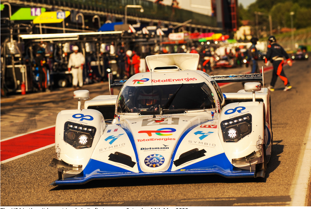
The H24 in the pit lane at Imola in its first race on Saturday 14th May 2022.

After the historic first at Imola (first participation of an electric-hydrogen prototype in an international race) MissionH24 is continuing its pioneering programme, and will be at Le Mans this week to compete in the Road to Le Mans events (Michelin Le Mans Cup races that are curtain-raisers to the 24 Hours of Le Mans). It will also be a historic premier as it's the first time that a hydrogen-powered vehicle entered in the experimental category by the H24Racing team will take part in races on the 24-Hours circuit.